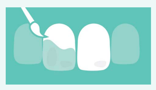
After being prepared with an etching gel, a liquid resin is applied, which penetrates into the porous tooth tissue where it is cured under light.