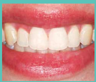
One week after treatment.