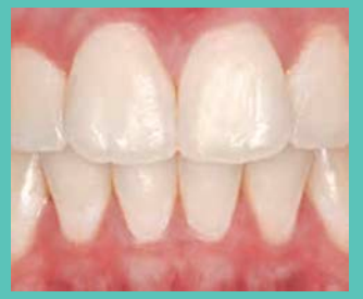
Result after polishing.