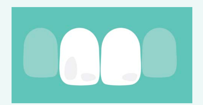
Before treatment, caries, fluorosis or enamel developmental defects have caused unesthetic discoloration.