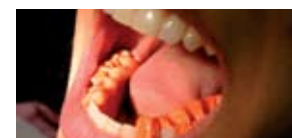
Exceptional occlusal accuracy is achieved with our proprietary vinyl polysiloxane matrix.

Now you have a choice of superior rigid bite registrations materials: O-Bite and bisacryl LuxaBite. All are ideal for capturing all types of bite relationships, easy to trim and are available in various dispensing methods. O-Bite is easily trimmed with a scalpel and LuxaBite is easily trimmed with a high-speed burr.