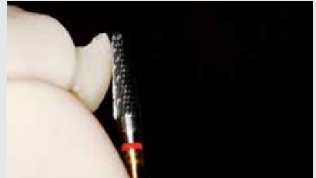
Refining the temporary with a bur.