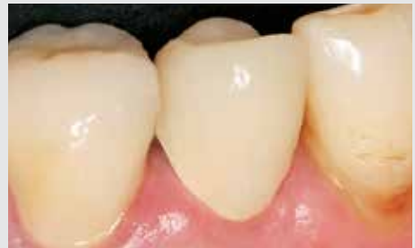
A highly esthetic, natural-looking temporary end result.