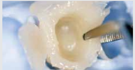
Removing the temporary from the matrix.