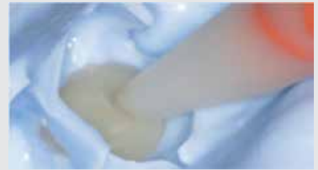
Luxatemp Ultra material being dispensed into a StatusBlue®* matrix.