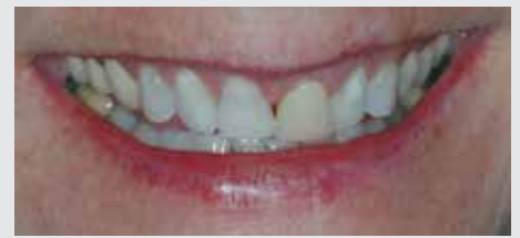
Before Luxatemp provisionals