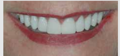
After Luxatemp Provisionals