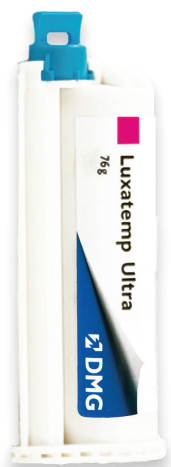
Marginal Color Changes – High Color Stability

Rated #1 in flexural strength , Luxatemp Ultra's high break resistance and improved initial hardness make temporaries more stable than ever before. Its extraordinary long-term color stability offers a guarantee you can rely on.