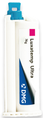
Marginal Color Changes – High Color Stability

Rated #1 in flexural strength , Luxatemp Ultra's high break resistance and improved initial hardness make temporaries more stable than ever before. Its extraordinary long-term color stability offers a guarantee you can rely on.