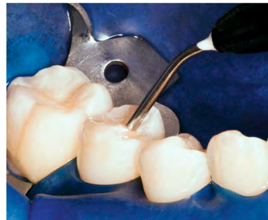
Constic is applied to the cavities/fissures using the Luer-Lock-Tip