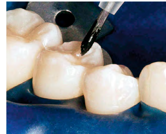
Constic is massaged into the entire tooth surface for 25 s using the included brush