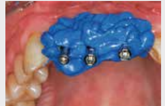
Complete syringing around impression posts.