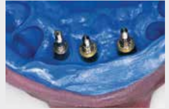
Fixation of impression posts in an individual, open impression tray, provides positionally stable fixation.