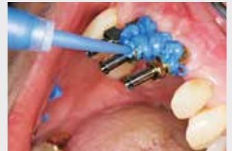
Syringing around the impression posts.