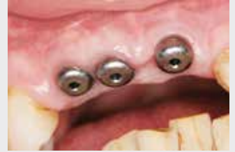
Gingival formers after the implants have healed into position.

Honigum Pro Heavy Quad Fast has extreme accuracy, stability, easy removal and rigidity for locked-in detail. This heavy consistency, faster-setting material is ideal for quadrant and single unit impressions.