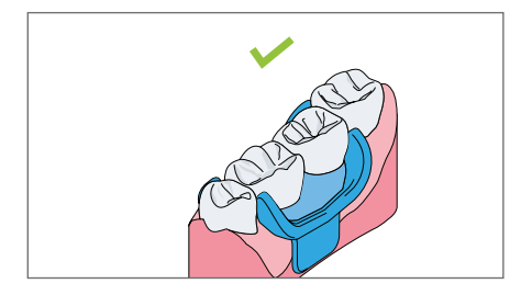
The DMG MiniDam stays in place securely without clamps.