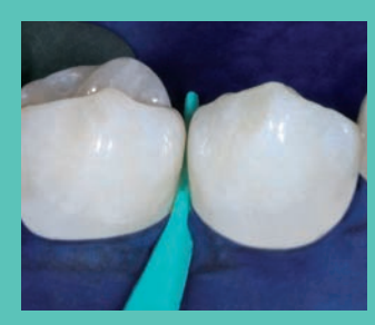
Separation with dental wedge.