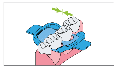
Release the DMG MiniDam and fold cervically.