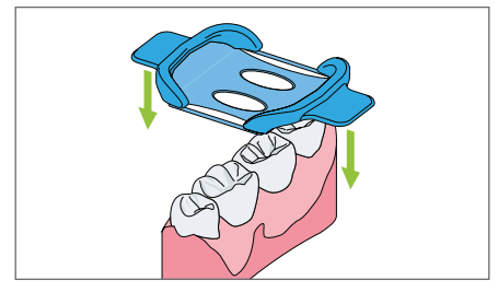
Stretch the DMG MiniDam and pull towards the gingiva.